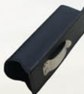
Battery carriage leather shift