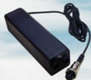
Lithium Polymer Battery