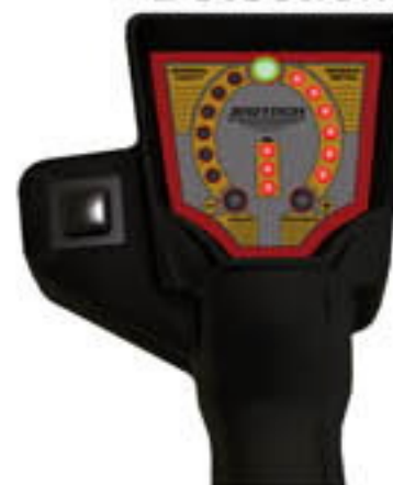
Ferrous Metal Detection