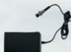
Universal AC charger 100 - 240 Volt, 50 and 60 Hz