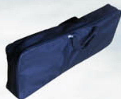
Condura Plastic carrying bag for all the equipments